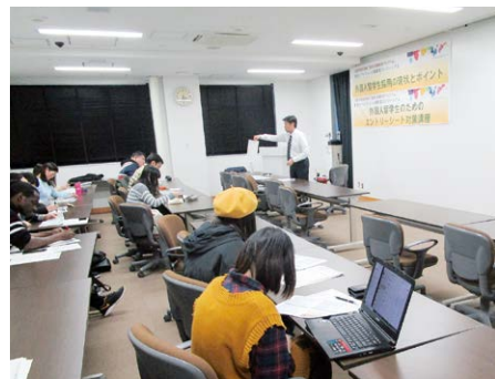
Entry Sheet Preparation