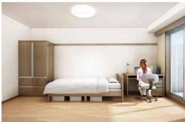
(Concept image of bedroom)

Open Living Rooms: 31.68 m 2 (1 per unit)