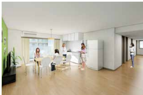
(Concept image of living room)