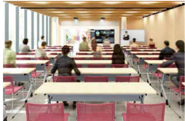
(Concept image of study room)