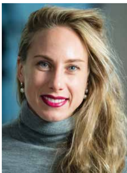
Polina Anikeeva, Ph.D. Massachusetts Institute of Technology, MIT Electronic, Optical, and Magnetic Tools to Study the Nervous System

We develop novel neural interface technologies aimed at mimicking the material properties and transduction mechanisms of the nervous system. Specifically, we create flexible and stretchable multifunctional fiber probes suitable for recording and stimulation of neural activity as well as delivery of drugs and genetic information into the brain and spinal cord. In addition, we develop a broad range of magnetic nanotransducers that can deliver thermal, chemical, and mechanical stimuli to neurons when exposed to externally applied magnetic fields.