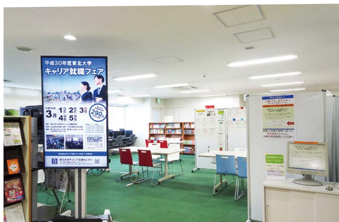
Kawauchi Kita Campus, Education and Student Support Center 3F Center for Career Support