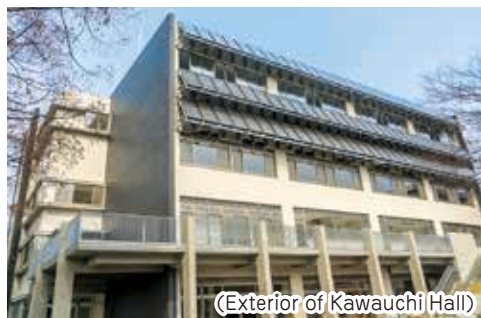
(Exterior of Kawauchi Hall)