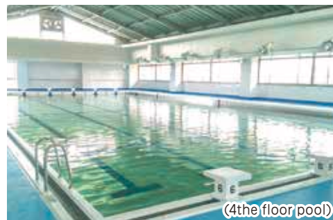
(4th floor pool)