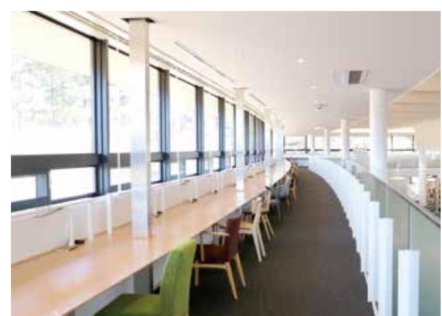
The loft offers ample natural lighting and seats that let students take in the scenery while they study. (Agricultural Library)