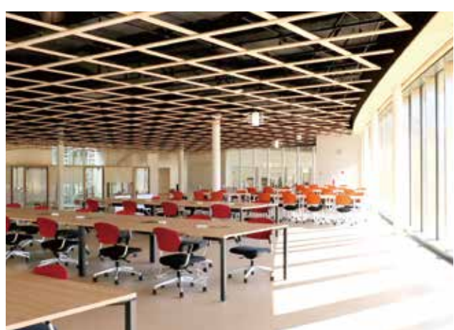
The Learning Commons Area encourages both independent learning and communication. Various events are held here too.