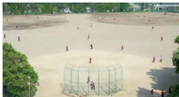
Kawauchi Baseball Field

The Kawauchi Grounds, Kawauchi Baseball Field, and Hyojogawara Athletic Field were refurbished in order to enhance university classes and extracurricular activities. Construction work was completed in December 2016. The main improvements are artificial turf and the addition of court lines on the Kawauchi Grounds, better drainage and soil improvement at Kawauchi Baseball Field, and the construction of an all-weather track, infield soil improvement, and the construction of a fence at Hyojogawara field.