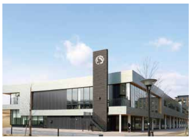
Two-story building in the middle of the new campus, between the University Park and Campus Mall.

The Aobayama Commons contains the Faculty of Agriculture lecture rooms, Agricultural Library, and Learning Commons. There are also a cafeteria (Midori Shokudo), store (Midori Shop), and nurse's office. The Commons opened in spring 2017 as a shared space for studying, relaxing, and communicating.