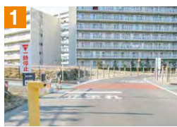
1 Intersection with footpath. You must stop at this intersection.

Take particular care to avoid hitting pedestrians and vehicles when traveling through the five danger zones shown below.