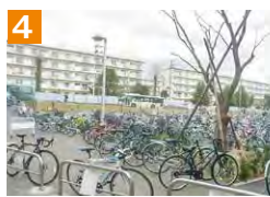
4 DO NOT park bicycles at campus entrances/exits. If there are no places to park, look for a place at another parking area.