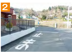
2 Area in front of the pre-school. Be extra careful of children in this area.