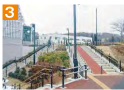
3 When moving between the road and parking area, cyclists must dismount and push their bicycles up the slope in the middle of the stairs. When descending too, cyclists must dismount.